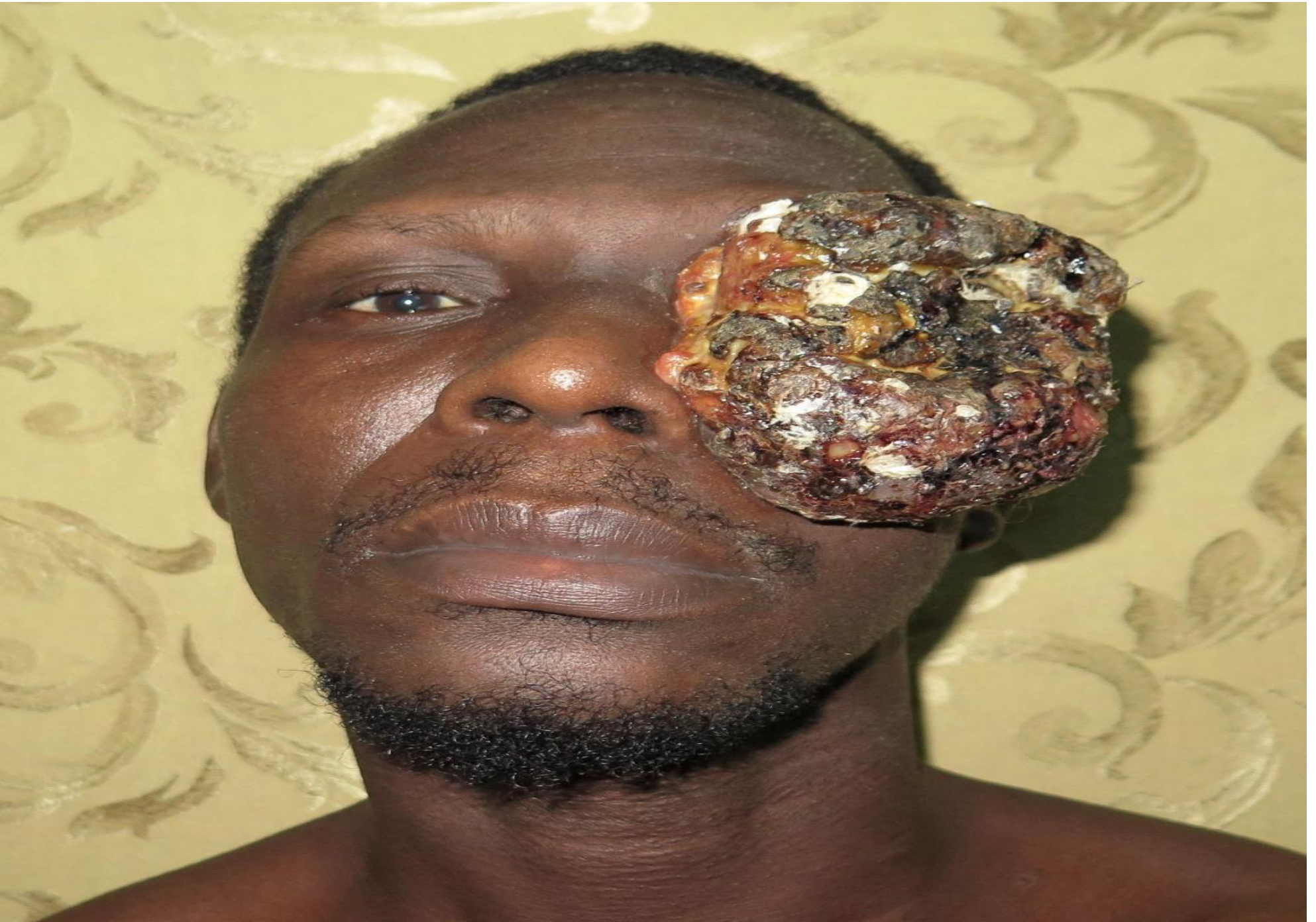
Photo: Before Surgery-This Patient had several types of Eye Cancer