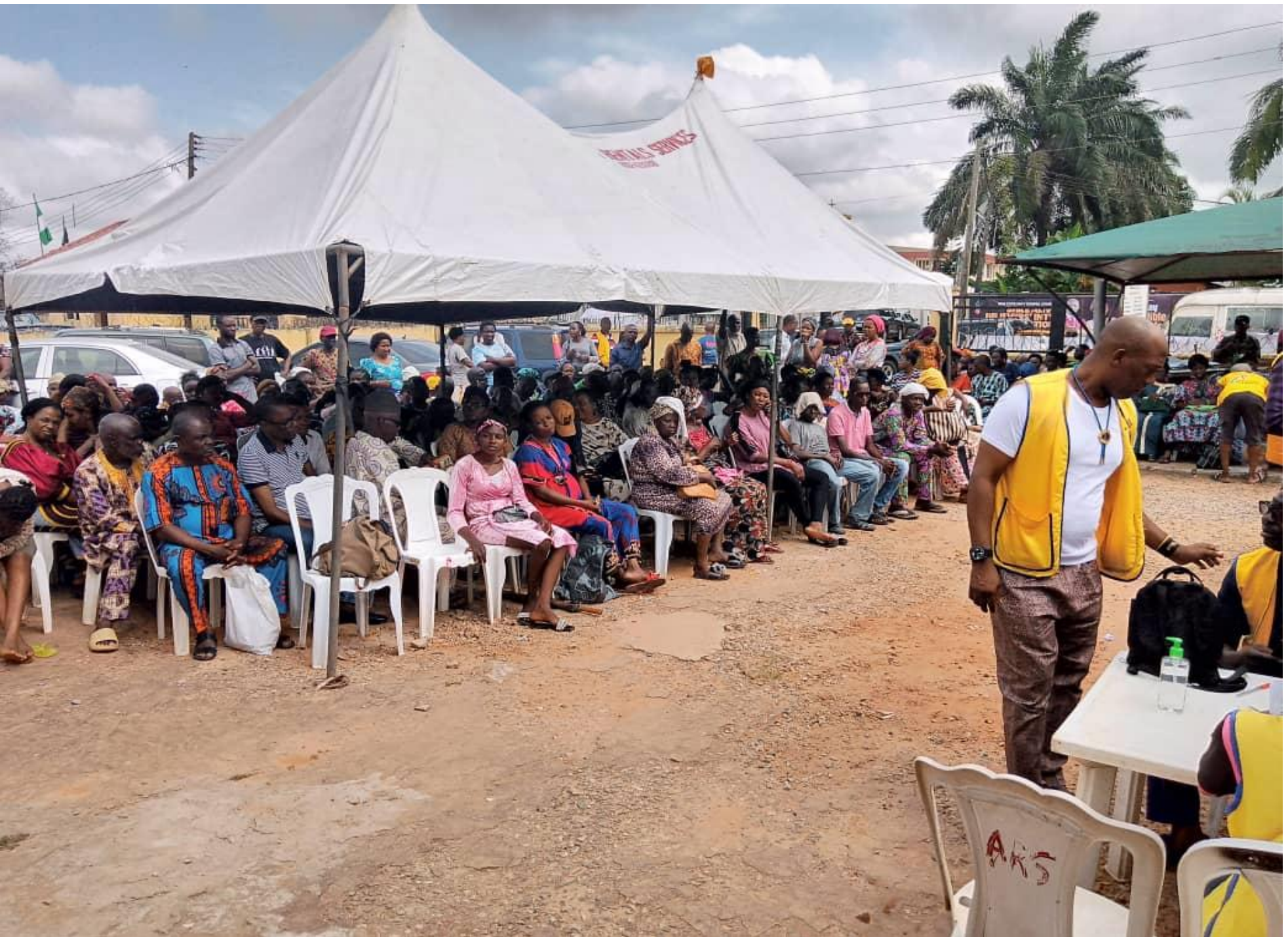
Photo: Hundreds of patients that showed up for PROFOH & Lions International Club Medical mission on World Sight Day