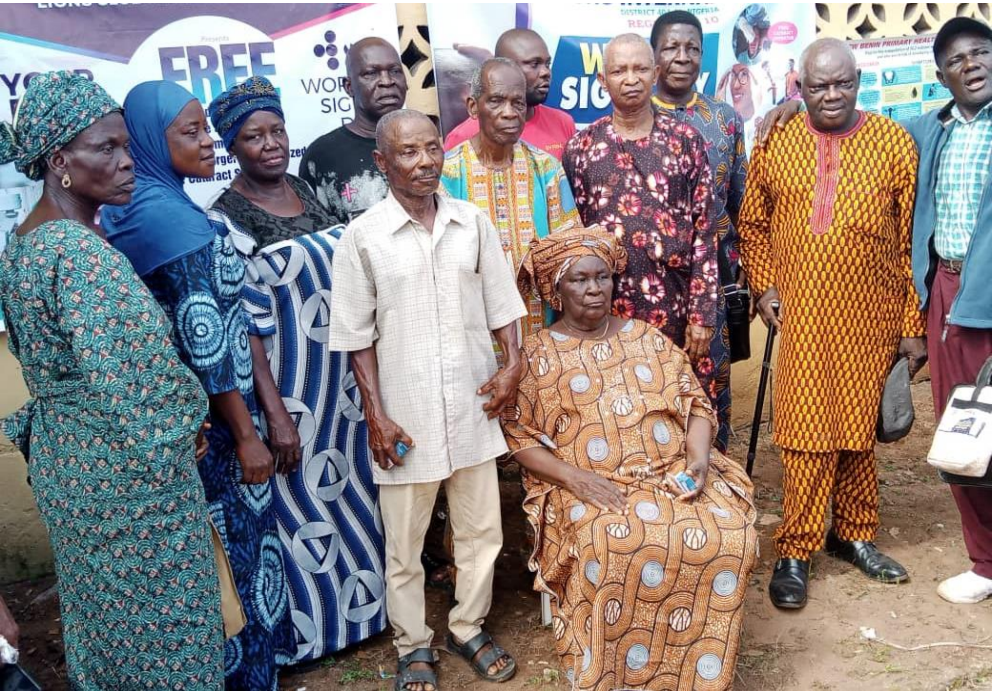
Photo: First group of patients that received Cataract surgery at PROFOH & Lions Club International during World Sight Day