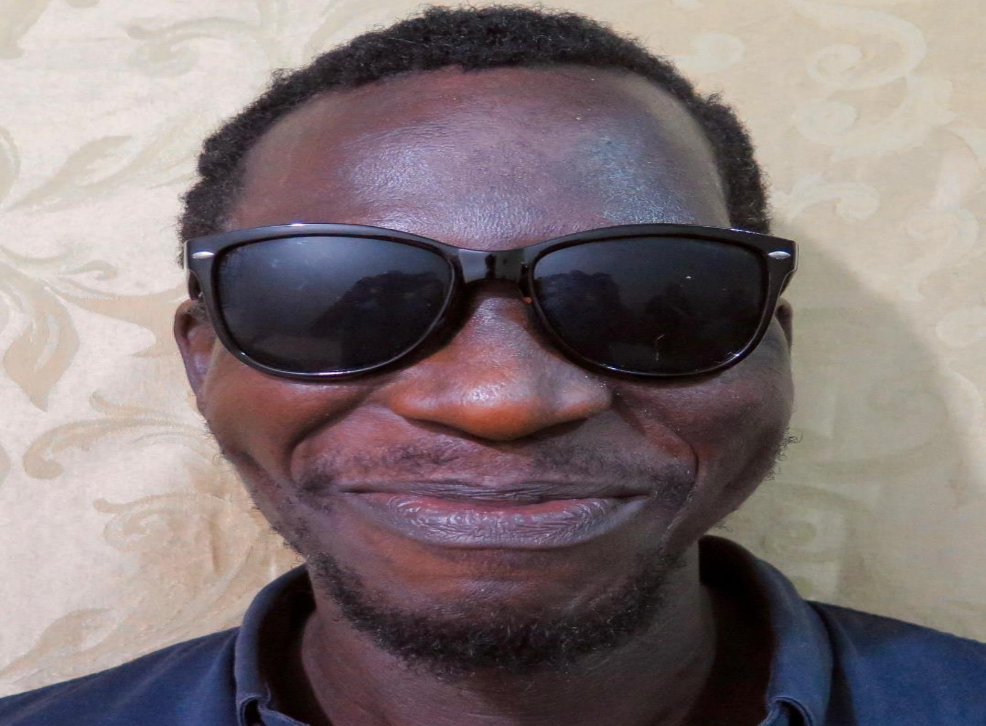
Photo: It included uveal melanoma-an intraocular melanoma.